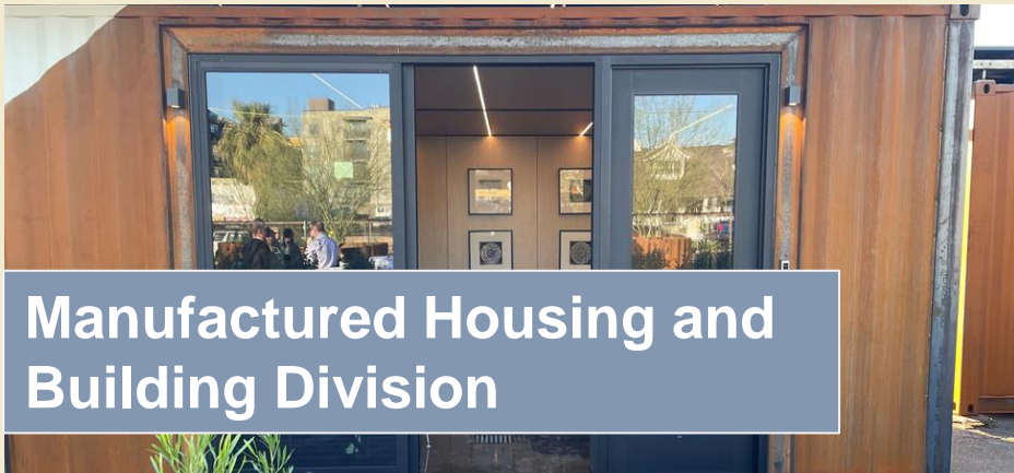
Manufactured Housing and Building Division