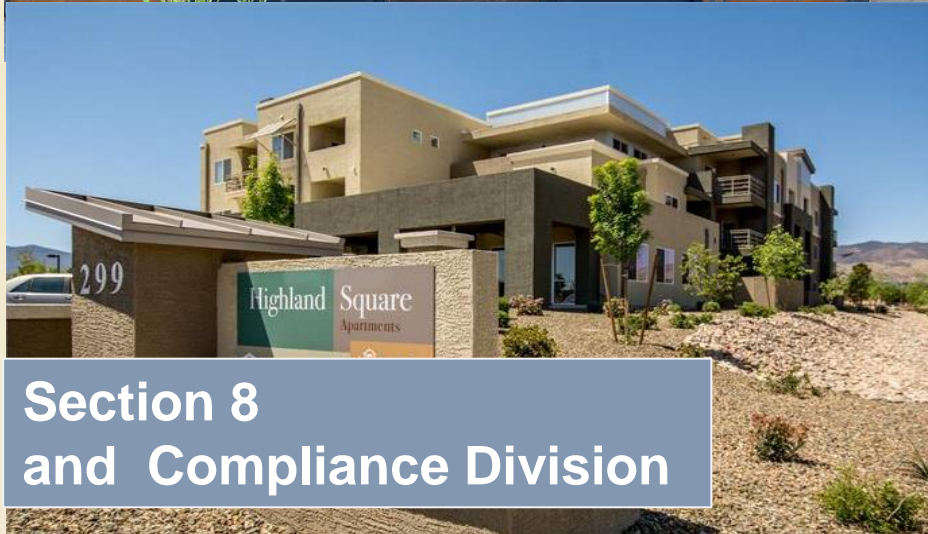
Section 8 and Compliance Division