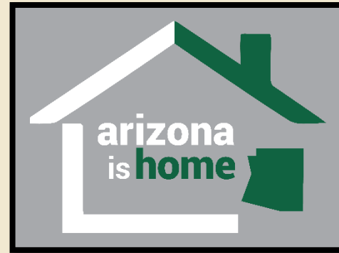
Homebuyer Programs and Operations