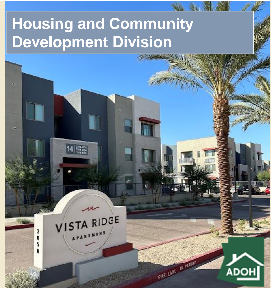
Housing and Community Development Division